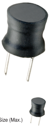
Actual Size (Max.)