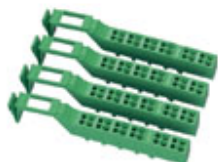
Connector set, for IB IL DO 16, copper, colored identification.

Please be informed that the data shown in this PDF Document is generated from our Online Catalog. Please find the complete data in the user's documentation. Our General Terms of Use for Downloads are valid ( http://phoenixcontact.com/download )