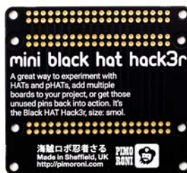
PCB only PIM171